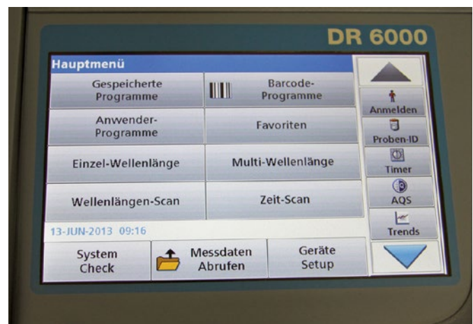
Touchscreen with clearly structured user interface

It is not only the barcode detection of round cells that enables faster sample processing, but also the RFID module. This technology not only makes it possible to identify the user using a RFID user transponder on the device; RFID transponders can also be used to identify the samples. First, this rules out sample mix-ups. Second, this facilitates or ensures traceability. The table on page 2 shows the technical data for the photometer.