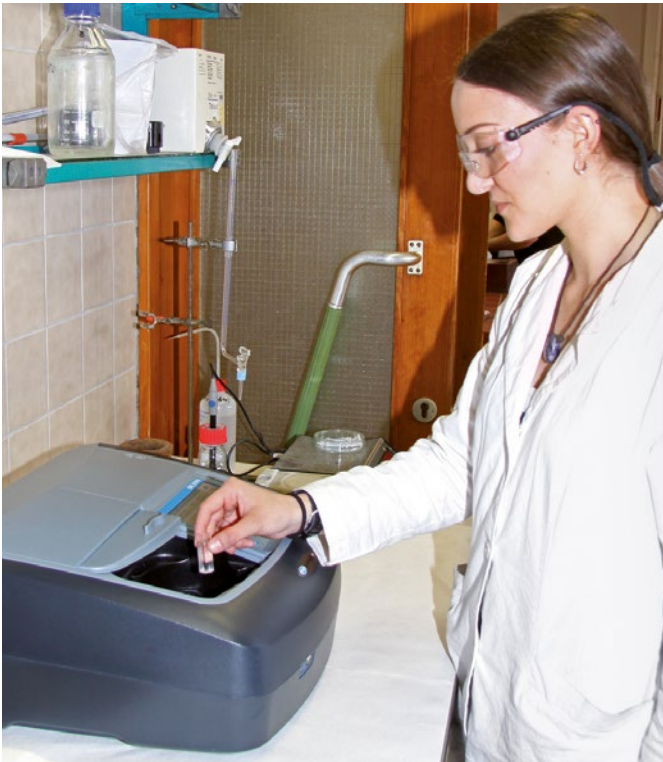
Figure 3: Sample insertion using a cell